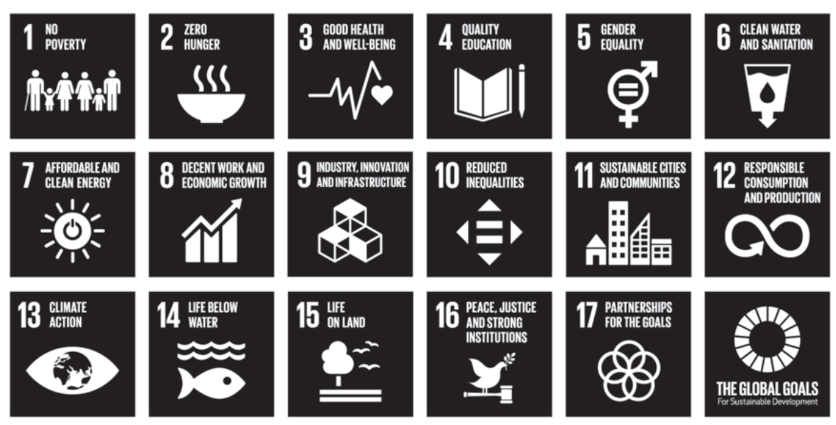
Figure 4 – Sustainable Development Goals. A global orientation towards sustainability (United Nations 2015).

However, it can take many years before just some of the conceptual and strategic considerations find their realization in regional management plans. One reason is that participative processes to define targets require time, and management plans usually cover a period of 10 years. Although minor adjustments to new policies can be implemented continuously, major amendments may be realized only in later management plans.